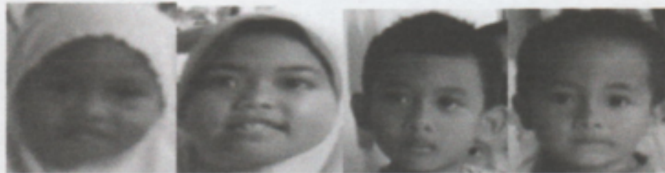
Fig. 1. Face Detection

Face detection is a challenge with increasing use in several applications. This is the first step for facial recognition, facial analysis and other detection of facial features [6]. The difference between face detection and recognition is that face detection exists to identify faces from images and find faces. Face recognition makes the decision "whose face is that?", Using image database [7]. In this case, using the cascade method. This method allows the background area of the image to be disposed of quickly while spending more calculations on the area such as promising objects [8].