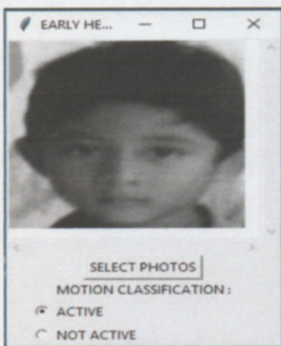
Fig. 5. early health detection system

262 images for training data were classified into 4 expressions. 50 pictures of facial expressions happy, 77 pictures of facial expressions sleepy, 67 images facial expression sad, and 68 images facial expression smile.