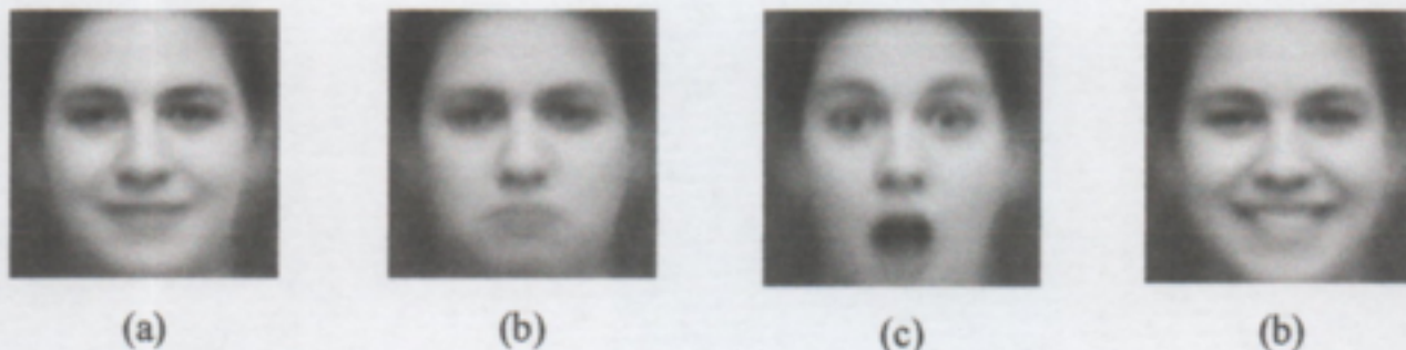
Fig. 4. Eigenface (a) Happy, (b) Sad, (c) Sleppy, (d) Smile

In research, all images are trained using eigenface and then stored based on their classification.